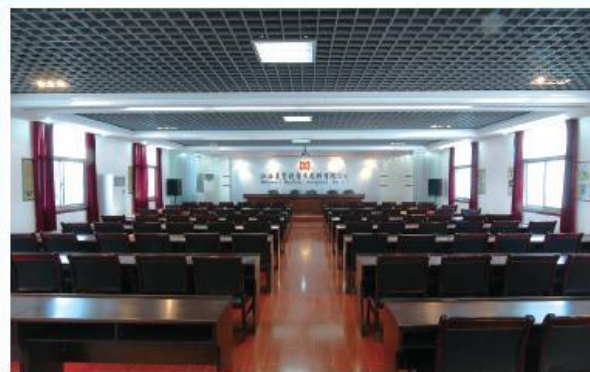
MEETING ROOM 会议室