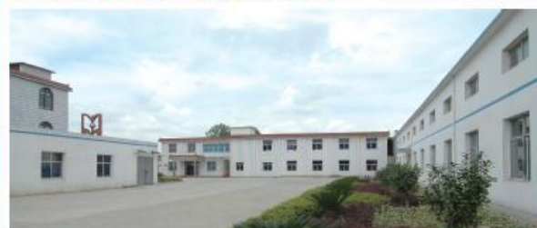
EXTERIOR SCENE OF THE PLANT 车间外景