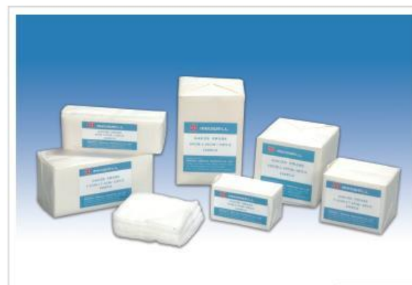
GAUZE SWABS 纱布片