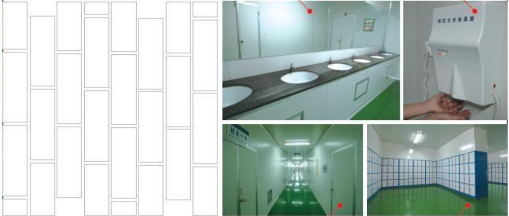
CHANGING CLOTHES ROOM 更衣室