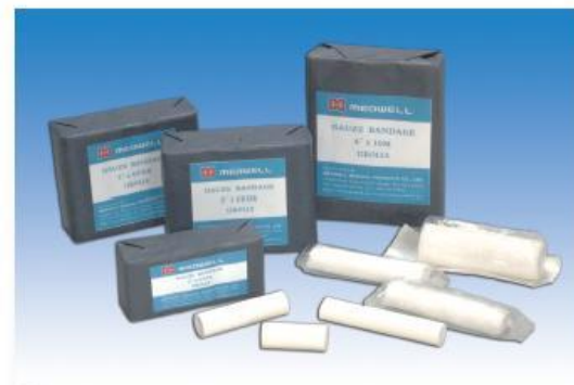
40'/30 x 20 White paper per roll, blue kraft per dozen (12) 40'/30 x 20 每卷白纸包 12卷蓝牛皮纸包装