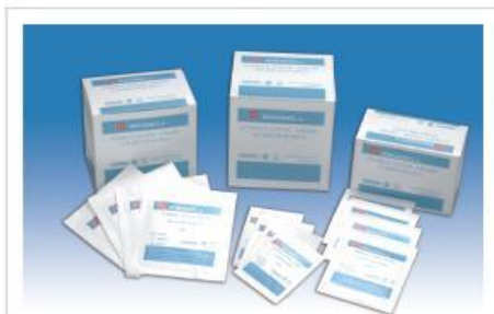
STERILE MOLD PACKING 消毒吸垫包装