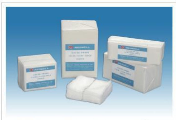
STERILE GAUZE SWABS 纱布片