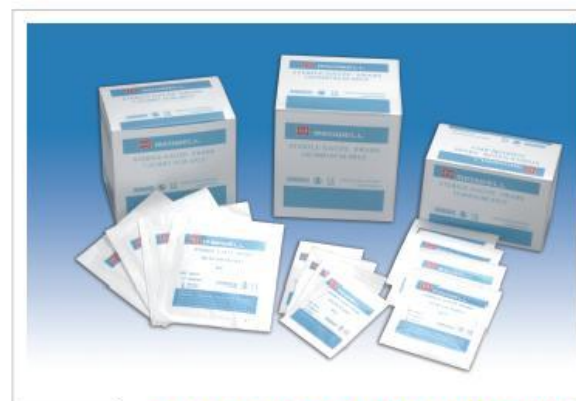
STERILE MOLD PACKING 吸塑包装